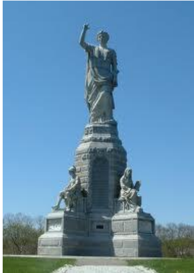
The National Monument to the Forefathers

The monument provides us a matrix of liberty based upon the worldview of our forefathers. Their ideas worked, as they gave birth to the most free, prosperous, virtuous, and just nation the world has ever seen. If we apply those same principles today, and build according to the successful pattern, we can expect the same results.