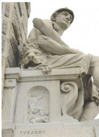
Tyranny being overcome by the vigilant.

Almost all the civil liberty now enjoyed in the world owes its origin to the principles of the Christian religion...The religion which has introduced civil liberty, is the religion of Christ and his apostles, which enjoins humility, piety, and benevolence; which acknowledges in every person a brother, or a sister, and a citizen with equal rights. This is genuine Christianity, and to this we owe our free constitutions of government. 11