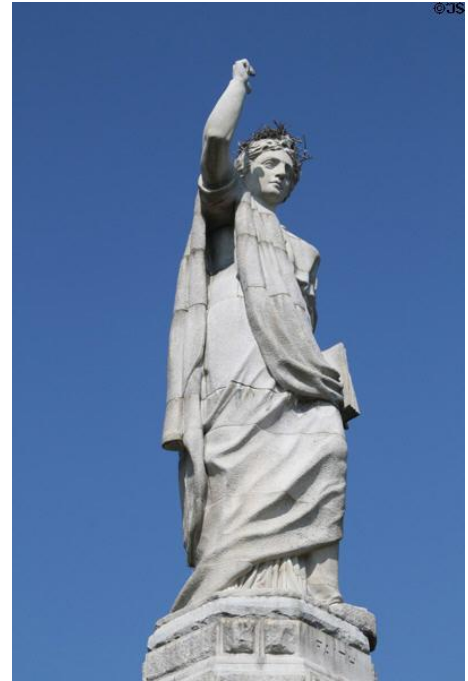
Faith is the central figure of the Forefathers Monument.

building the nation upon the Christian faith and worldview.