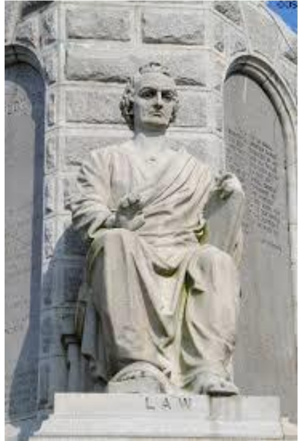
The statue of Law has a copy of the law in his left hand, and his right hand is extended in mercy, indicating our forefathers sought to administer civil justice while always having God's mercy in view.

God's law-word will provide justice to all members of society, because all people stand equal before His law. Yet, the Scriptures reveal that God is not only just, but He is also merciful. The two carved reliefs underneath the throne where Law is seated reflect this, as one represents Justice and the other Mercy . Our forefathers sought to administer civil justice while always having God's mercy in view.