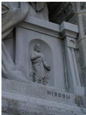
Wisdom is pointing to the commands and an open Bible.

Education in America for the first few centuries was centered in the home, because everyone believed it was the right and responsibility of parents to govern the education of their children. A statue to the Pilgrim Mother in Plymouth, Massachusetts, bears the inscription: “They brought up their families in sturdy virtue and a living faith in God, without which nations perish.” The