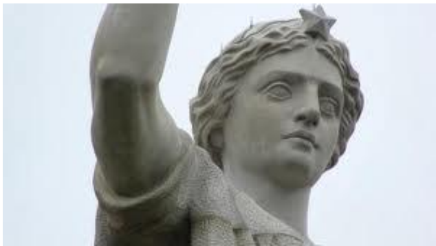
Faith has a star upon her head.

Central to the Christian faith is the message that God through Christ redeems man and gives him a living faith through a supernatural internal transformation of the heart. God via His Spirit gives man a new nature and writes His law upon man’s heart. This internal transformation is the beginning of building godly nations. Since only the God of the Bible can bring about this supernatural transformation, only the God of the Bible can change a nation for good.