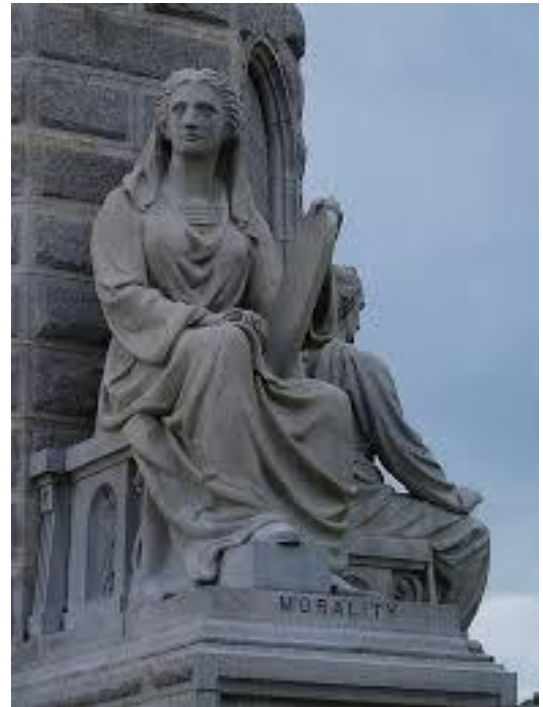
Statue of Morality , holding the Ten Commandments in her left hand and the scroll of revelation in her right.

As we mature as Christians, we become more like Him in character and thought. We gradually display more of His holiness and character, seeking to be honest, loving, kind, pure, self-governed, industrious, and much more. This Christian character or morality is essential for a free nation. A nation of regenerated men is essential for a nation of free men. The statue representing Morality has no eyes for she is looking inward, indicating there must first be internal liberty within man before there can be external liberty in society.