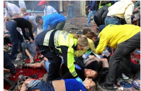
Muslim terrorists bombed Brussels, March 22, killing 31 and wounding hundreds.

This question was asked by many in Belgium after Islamic terrorists bombed the airport and subway in Brussels on March 22, 2016, killing 31 and wounding 270. Similar questions have been asked after other recent acts of terror, including the events on 9-11, the terrorist attacks in Paris, and the shooting in San Bernardino. Leaders, the media, and citizens ask, “Why would people commit such atrocities?”