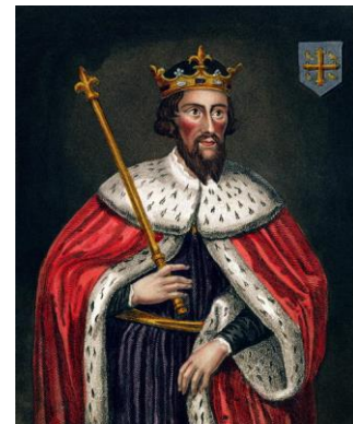
King Alfred, who united and ruled England from 871-899, wrote a code of law based upon the Ten Commandments and Jesus’ golden rule.

A Biblical view of man and government gave rise to the recognition and protection of God-given inalienable rights for mankind, including the rights to life, liberty, and property, as well as freedom of worship, speech, assembly, and the press. These freedoms are secured by the constitutions and civil documents originating in Christian societies.