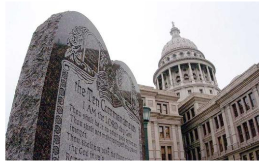
The Ten Commandments at the Texas Capitol