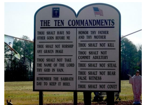
Commandments at a Pennsylvania school