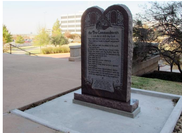
The Ten Commandments at the Oklahoma Capitol

Yet, if we do not know His commandments and how they apply to all of life, we cannot obtain the good fruit that comes from obeying them. Most Americans and, sadly, most American Christians, are ignorant of God's moral law. In the fall of 1997, a friend of mine took a survey of 500 men attending the Promise Keepers prayer gathering in Washington, DC, asking them to name the Ten Commandments in the order they appeared in their Bible. Only one of these sincere and devoted believers could do so! I have taken numerous surveys of people attending our seminars asking the same question. Only a small percentage of them have been able to list the commandments in order, and there has never been a majority of attendees who could list all ten even in random order.